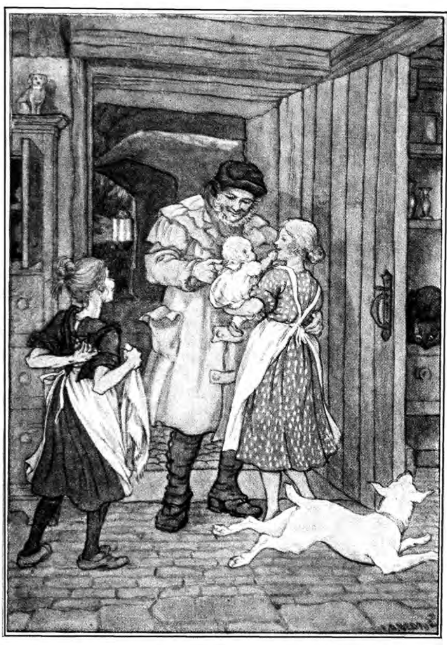
A live baby there was in Mrs. Peerybingle's arms