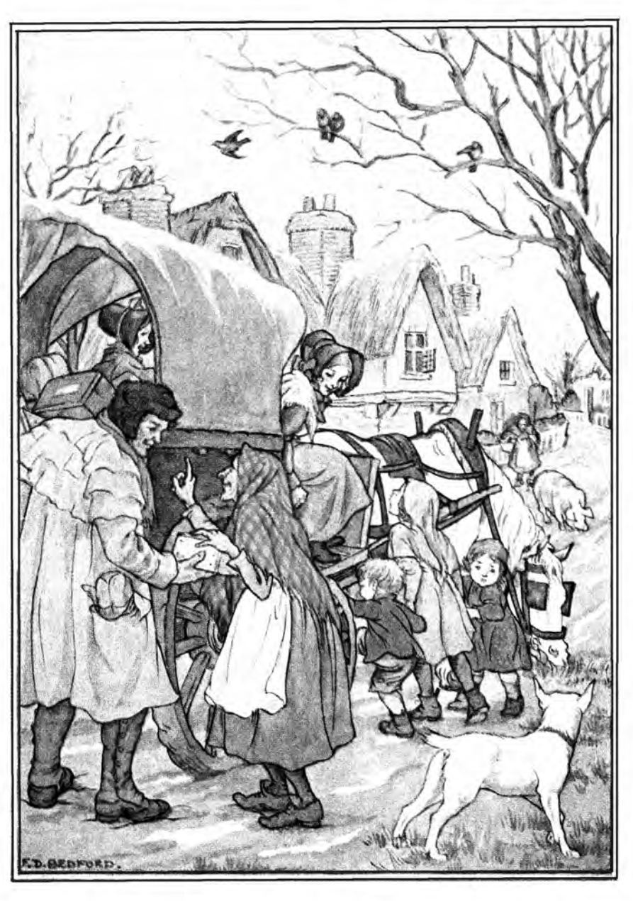
Inexhaustible directions about their parcels.